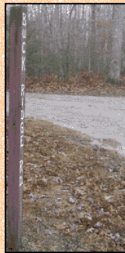
Name from side of post

Google Map marker does not correctly locate the cabin on map. Cabin is at the end of the road.