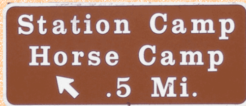
Sign, easily seen at night. Located immediately past Wilderness Trail.

If you pass this sign while on Station Camp Rd., you have missed your turn.