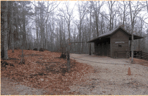
Bear left at the stable.

Travel 0.1 miles on Tom T. Hall driveway.