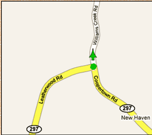
TN-297 runs West from Oneida, TN and ends at TN-154

Travel north from this point for 3.8 miles on Williams Creek Rd and Station Camp Rd